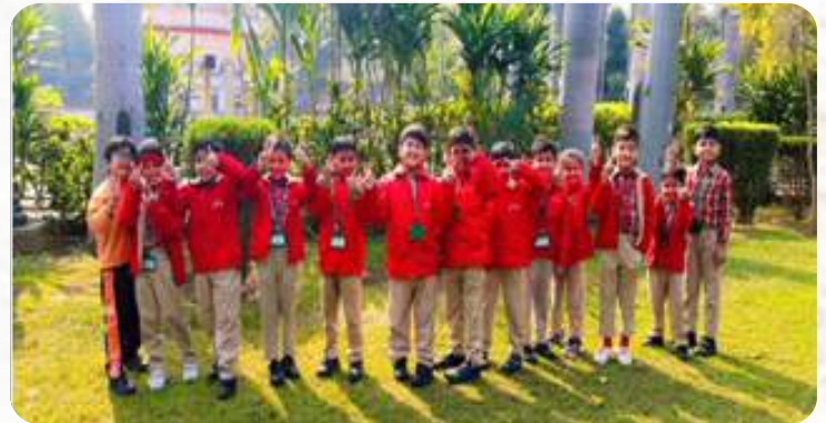
Visit to Italian Garden (Classes Nursery to UKG)