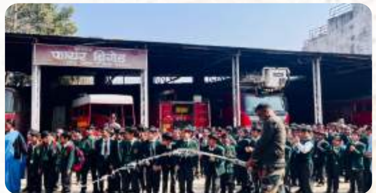
Visit to Fire Station (Classes I and II)