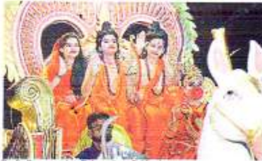
दिल्ली पब्लिक स्कूल के वर्धिमोसाव में प्रस्तुति देते बच्चे।