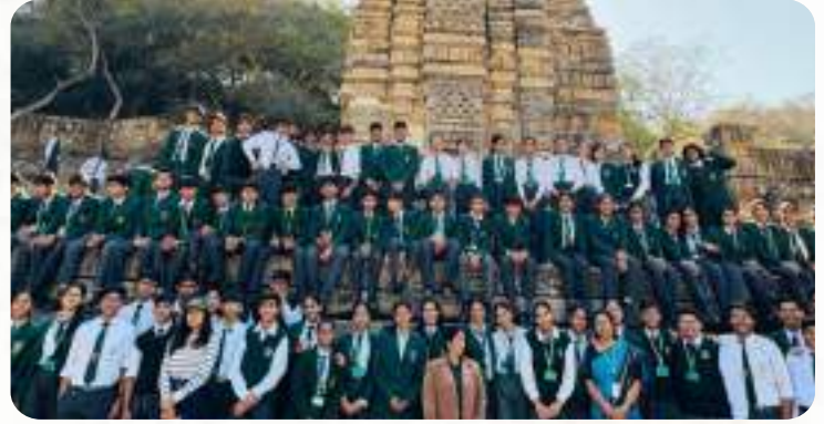
Visit to Bateshwar (Class IX)