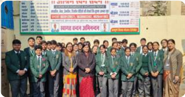
Visit to Swarg Sadan Ashram (Classes VI to IX)