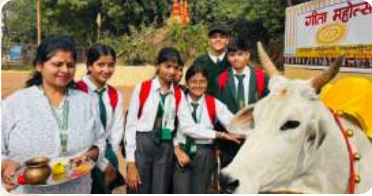
Visit to Laal Tipara Biogas Plant (Class VIII)

“Learning outside the classroom creates memories that lessons alone cannot.”