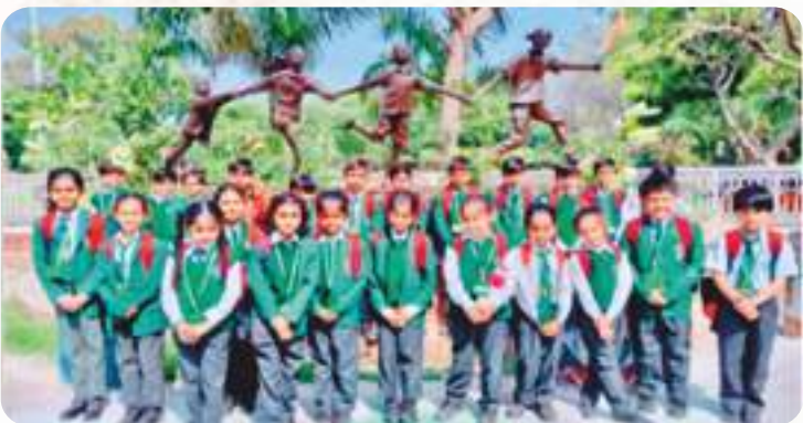
Visit to Bal Bhavan (Classes I and II)