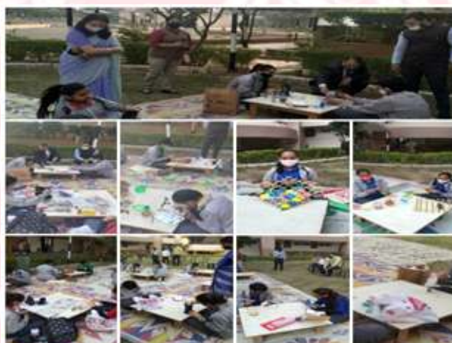
'Best Out Of Waste' (Classes IX and XI)