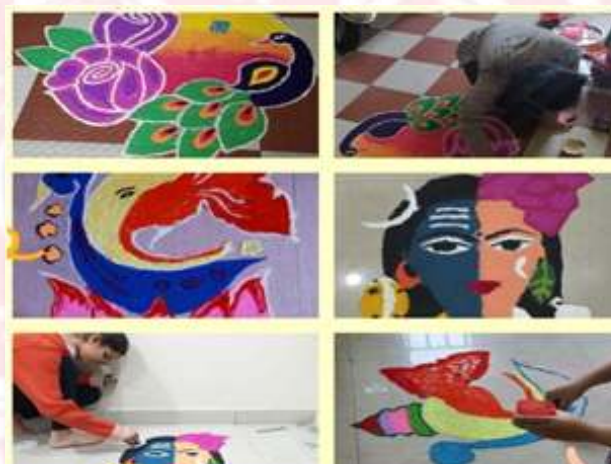
Rangoli Classes IX and X)