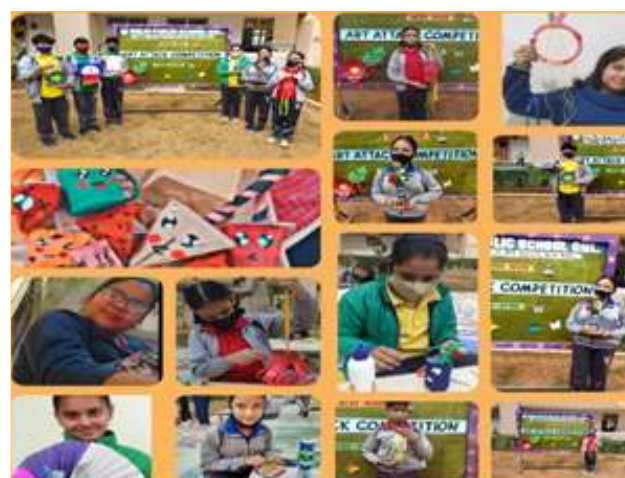
Art Attack (Classes VI-VIII)