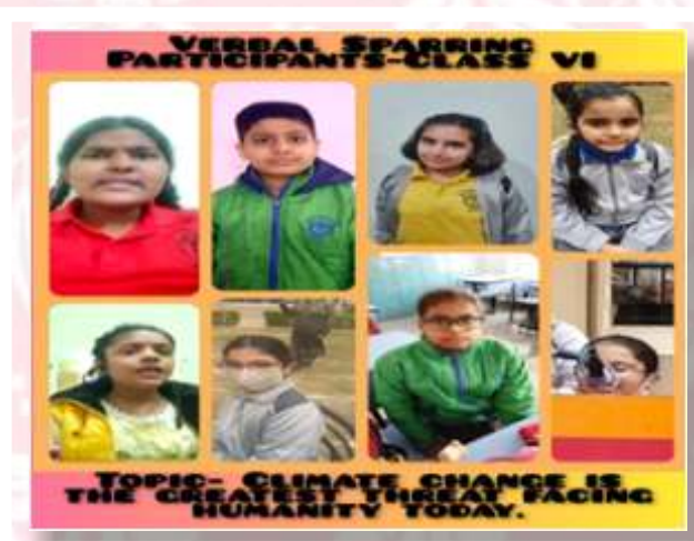
Verbal Sparring (Classes VI-VIII)