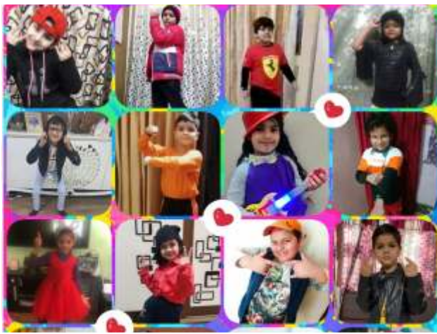
Western Dance (Class-I)