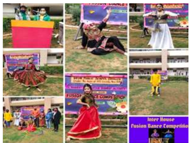
Solo Dance (Classes VI-VIII)