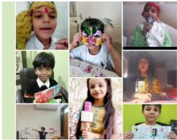
Poetry Out Loud (Class- II)