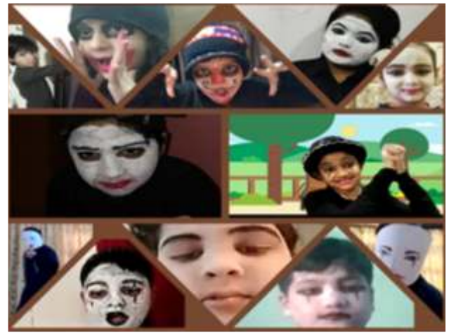
Child Safe (Performng Art Mime) (Class III)