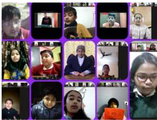
Dress and Tell (Classes III to V)