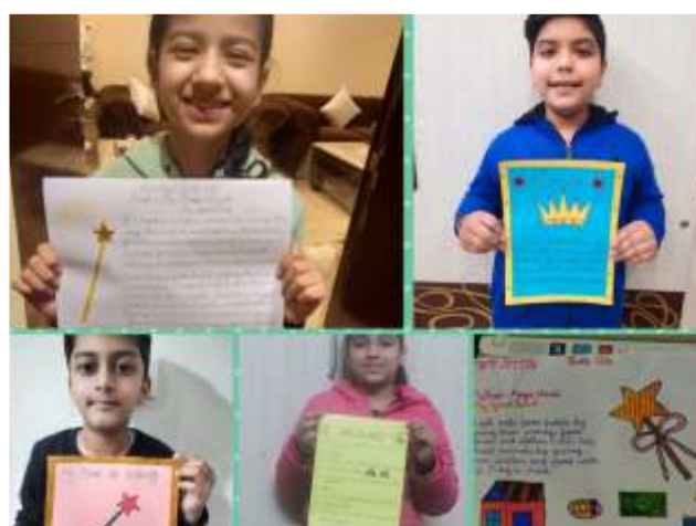
Prop Up (Classes III to V)