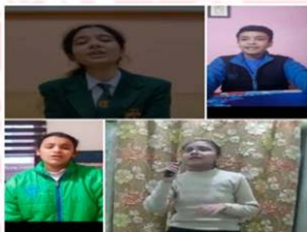
Singing Superstar (Classes IX and X)