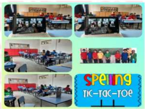
Tic Tac Spell (Class IV)