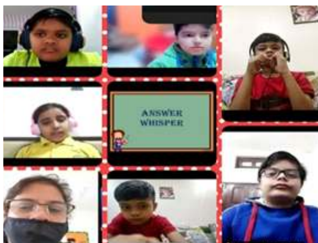
'Spell Bee' (Classes III to V)