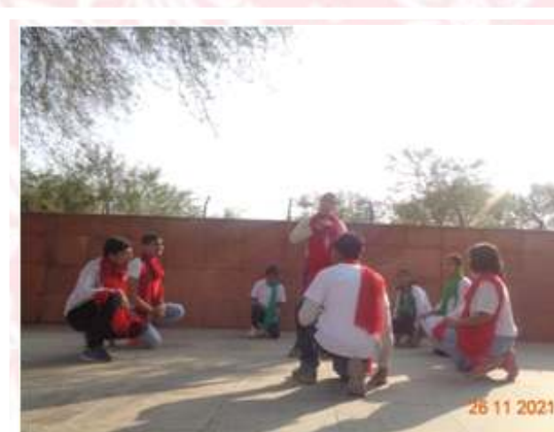
Nukkad Natak (Class IX)