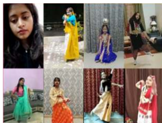
Solo Dance (Classes III to V)