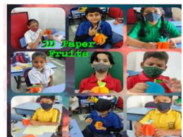
Card Designing and 3D Paper Fruits (Classes III to V)