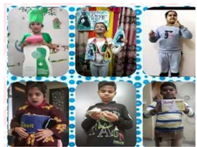
Mad AD Show (Classes III to V)