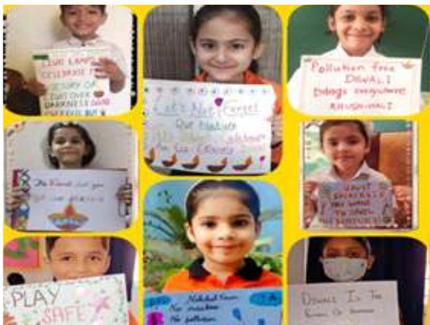
Anti Cracker Campaign (Class- I)