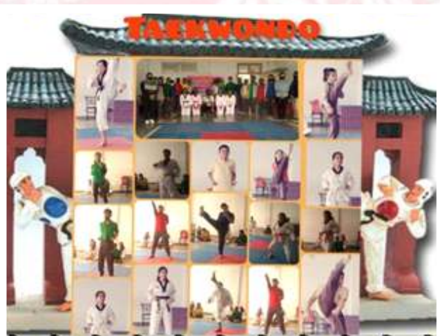
Taekwondo (Classes VI-VIII)