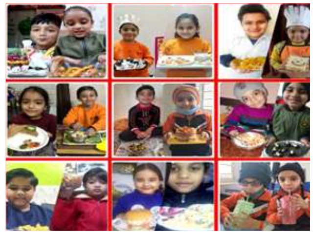
Bite and Taste (Class- I)