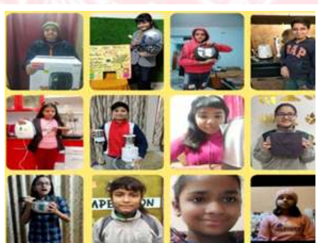
Virtual Advertisement Show (Classes VI to VIII)