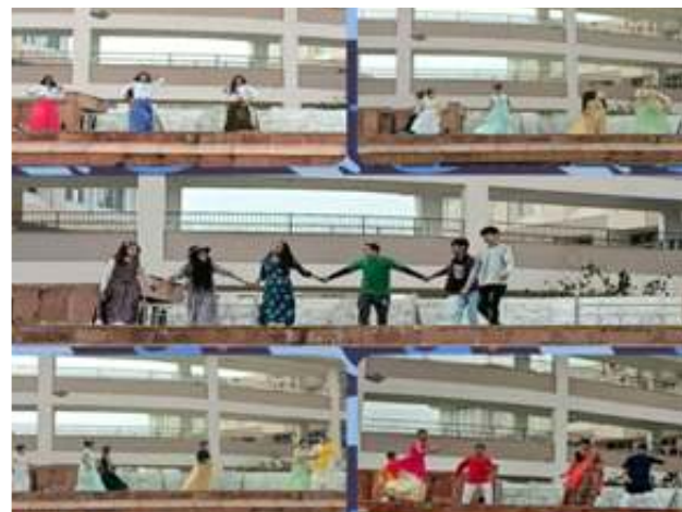
Folk Dance (Class IX)