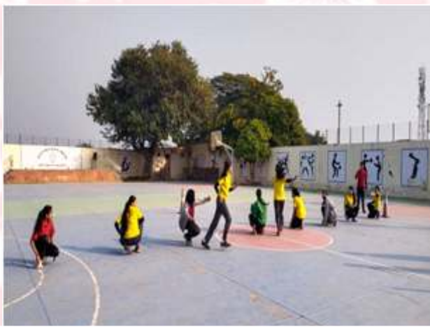
Kho Kho (Class-IX)