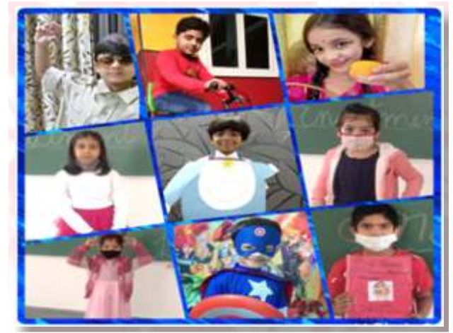
Battle of Books (Class-II)