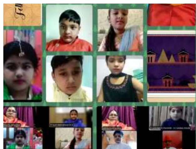
Folklore Fun (Classes III to V)