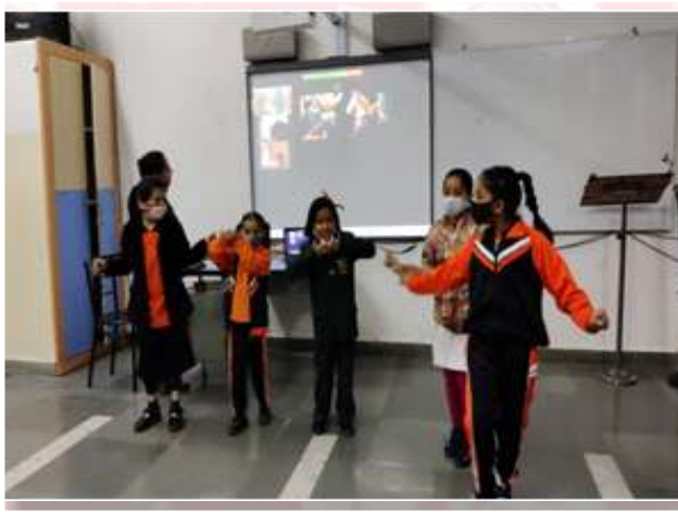
Balcony Seat (Class-II)