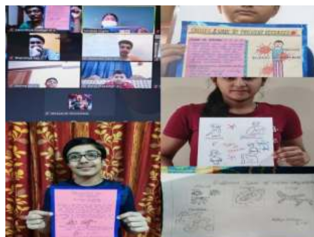
Poster Making (Class IX)