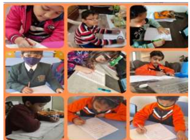
English Handwriting (Class- II)