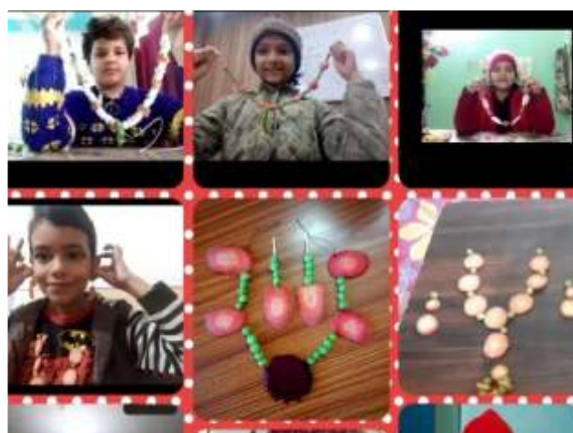
Jewellery Making (Classes III to V)