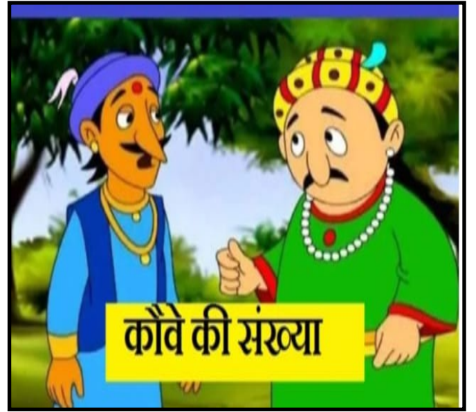
कौवे की संख्या

हम रोज़ सुनें कहानी, दादा दादी की जुबानी नित सुन सुन नई कहानी, बन जाएँगे हम ज्ञानी टी.वी. और मोबाइल से दूर, प्यारे लगते नाना नानी हँसी ठहाकों से भरपूर, पंचतंत्र की कहानी ॥